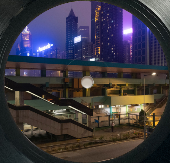
LABEL SIDE B